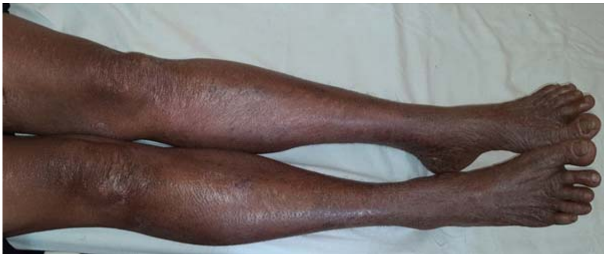
Figure 2. Resolved cutaneous skin lesions over bilateral legs.

Despite the background history of Grade 2 fatty liver dyslipidemia disarranged liver enzymes, She was started on acitretin 20 mg daily. Her liver and lipid profiles were monitored twice weekly for the first 2 months of therapy, then every 3 months. There was a marked improvement in skin lesions with stable liver function and lipid levels six weeks after commencing acitretin (Figure 2).